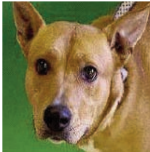
Proud Sponsor of Jane

CRCG (Canine Rehabilitation And Conditioning Group) 303-762-SWIM www.dog-swim.com