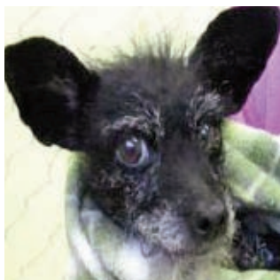
Proud Sponsor of Taryn

small earth vintage vintage clothing for the modern person www.smallearthvintage.com