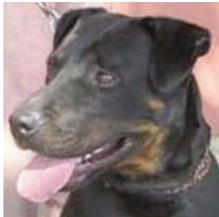
Proud Sponsor of Dazzle